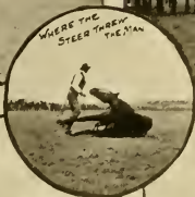
WHERE THE STEER THREW THE MAN